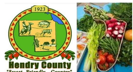
Hendry County Ag Tour