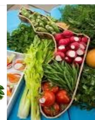
Hendry County Ag Tour