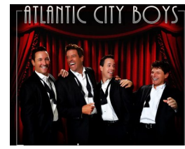
Atlantic City Boys