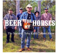
Toby Keith Tribute