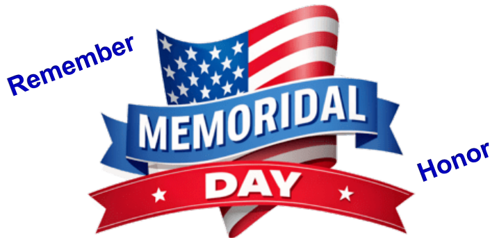
May 25, 2026