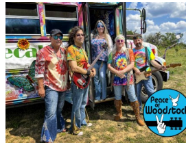
A Peace of Woodstock