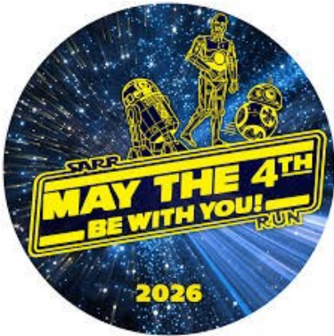
National Star Wars Day May 4, 2026