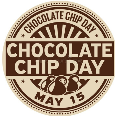
National Chocolate Chip Day May 4, 2026