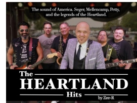
Heartland Rock Tribute to Seger, Mellencamp & Petty